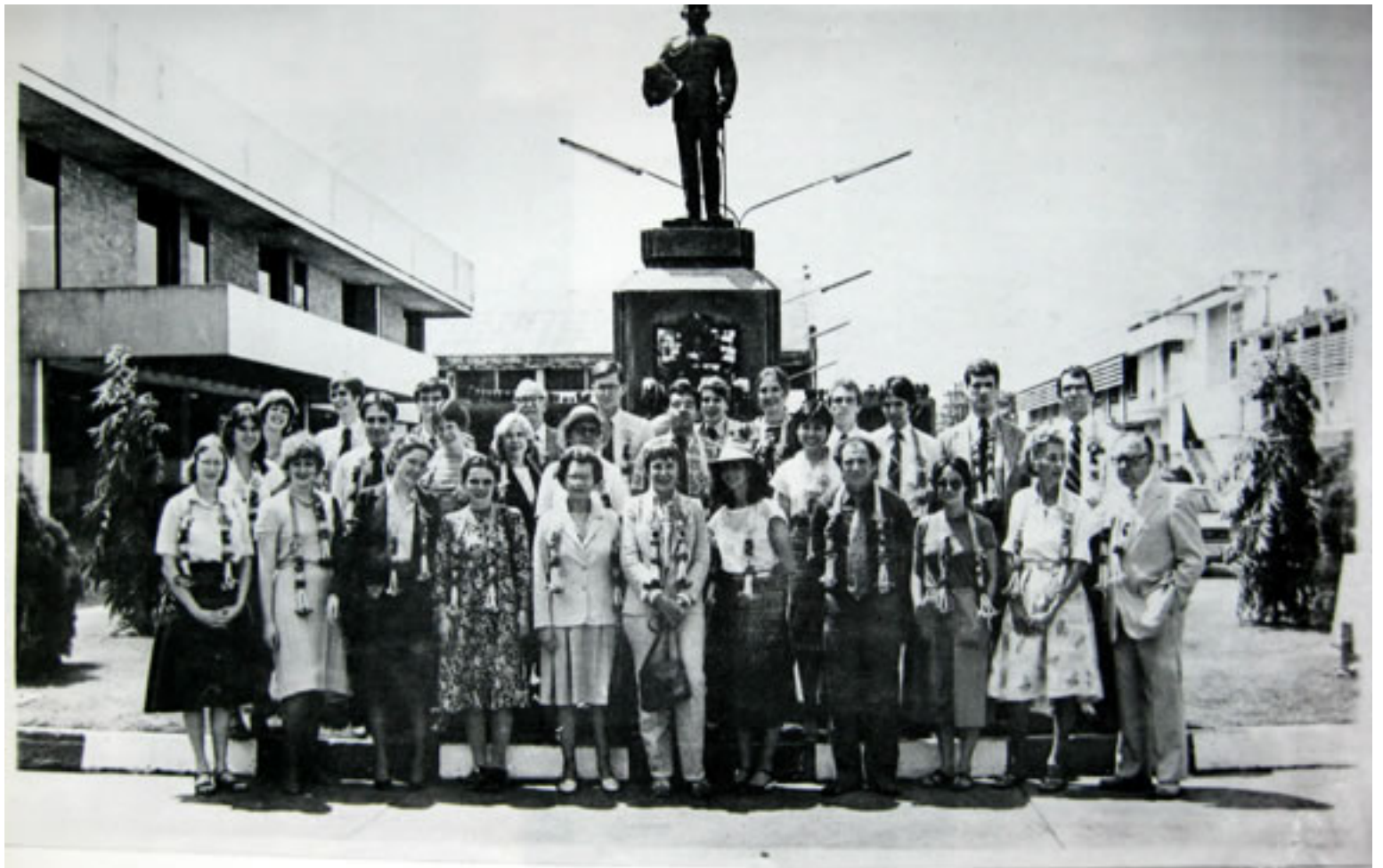
WELCOME TO THAILAND