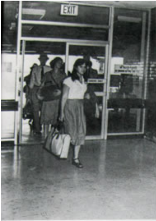
In the out door ... typical of 73?