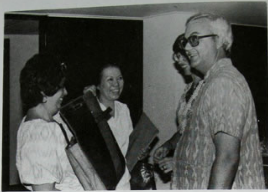
You should see what else I have in here !