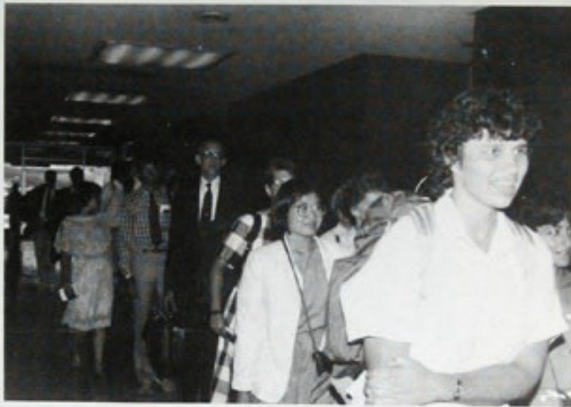
Here they come !