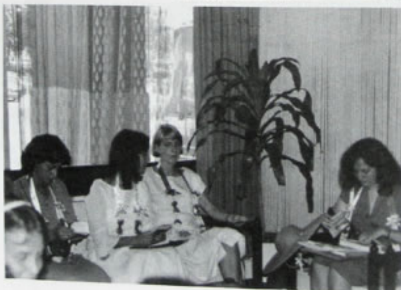
Do you really think we ought to give him our passports ?