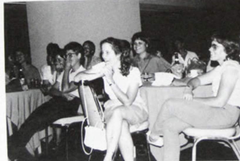
Thai 82 Friday Night Live !

" Peace Corps, the toughest job you'll ever love. "