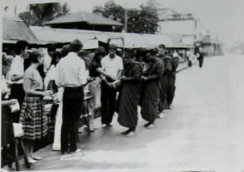
Our first opportunity to Tak Baat.