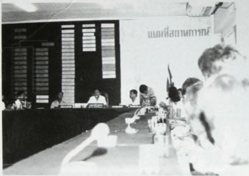
Meeting the Governor in Kamphaengphet