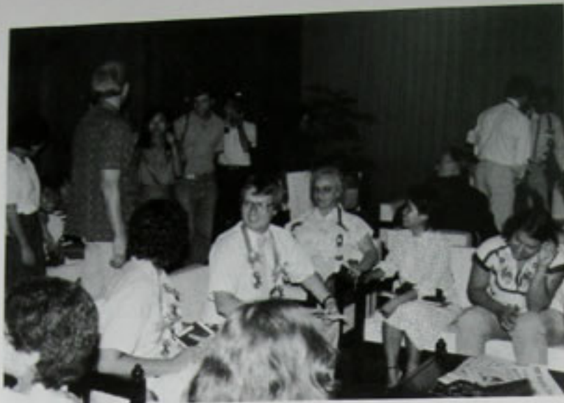
Yeessoon, you forgot the cue card !