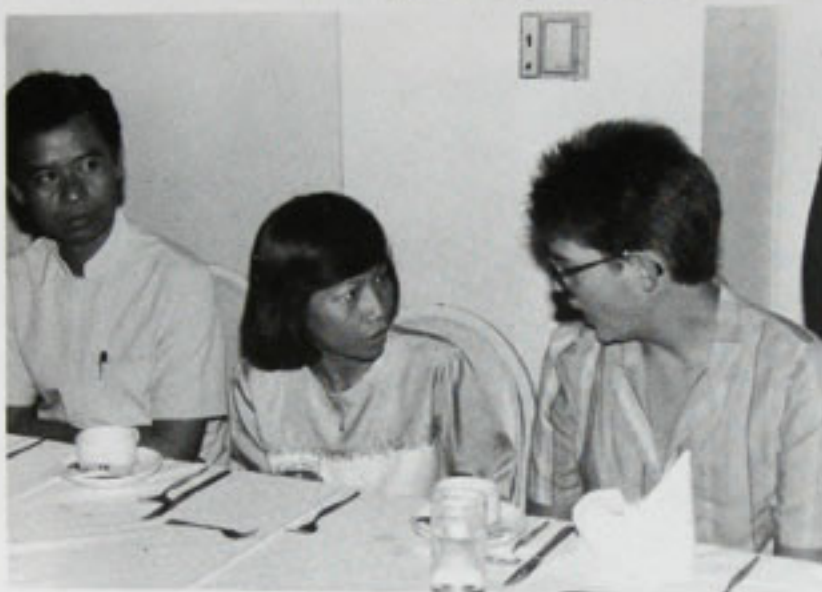
What ? I don't believe it !