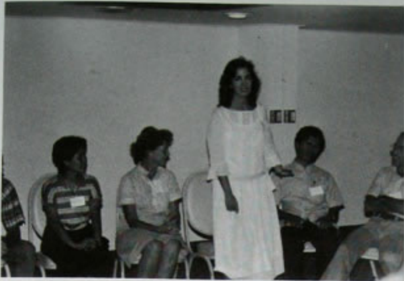
Take this guy for example ...