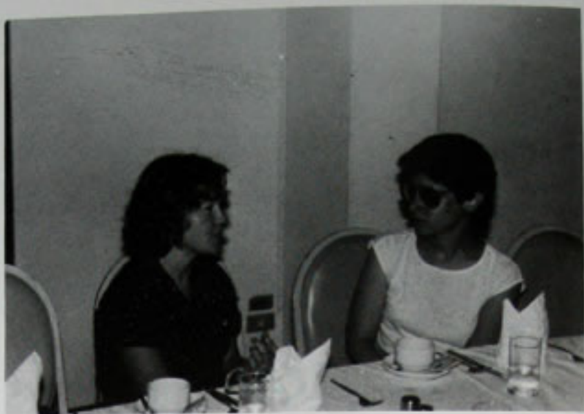
Khun Patty meets Khun Ellen.