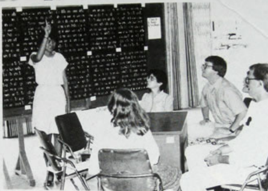
" Let's begin with the basics. The sky is up there ... "