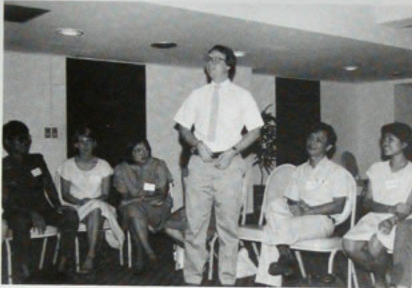
Four score and 45 minutes ago ...