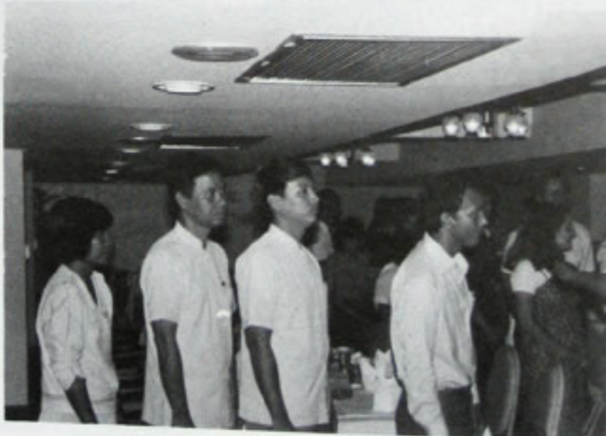
Ministry liaison folks join us in welcome luncheon.