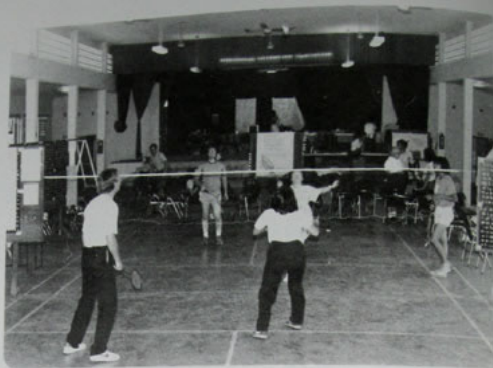
All work and no play ...