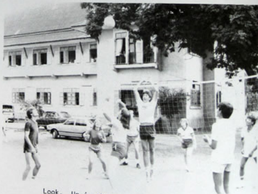
Look. Up in the sky. It's a bird ! It's a plane ! It's ...