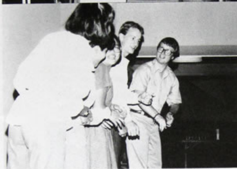
Little Richard and the International Quantut on tour.