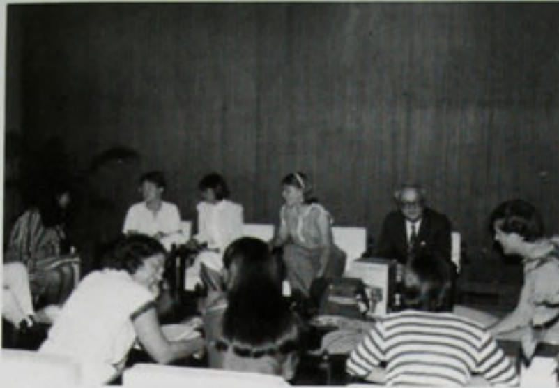
The staff in waiting