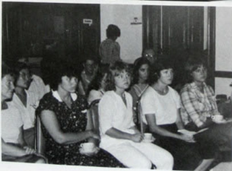
Well, we've all got jet lag ya know!