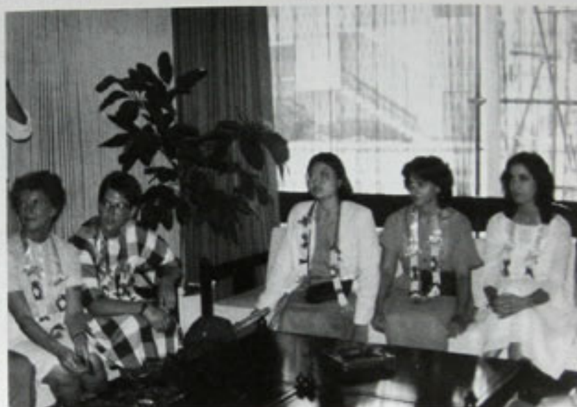
It's okay you can relax !