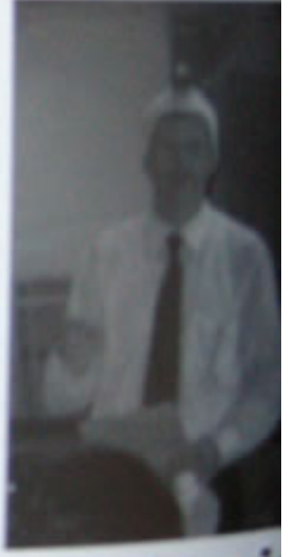
the meetings begi